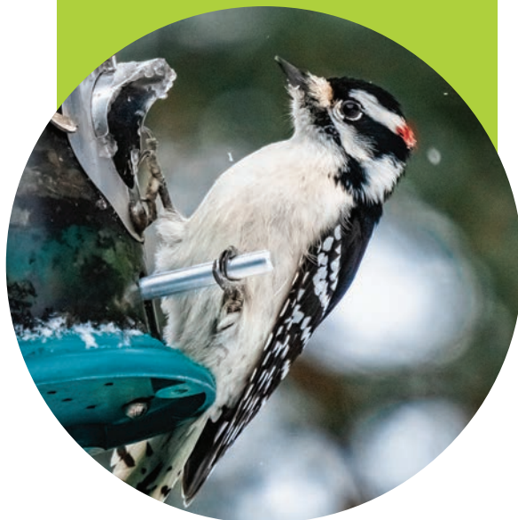
Downy woodpecker at Downs Farm Preserve in Cutchogue.

Count birds with the Group or in your own backyard next winter! Learn more and sign up at FeederWatch.org .